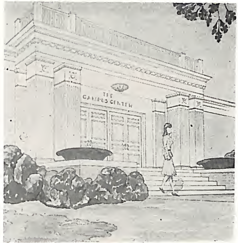
Front Of Proposed Student Center, Cafeteria